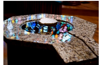
The Christ the Good Shepherd Window reflects on the water in the baptismal font.

So, here is a suggestion. Get your Bible out — dust it off if it needs it. Go outside on your deck, patio or yard. Find a comfy place. I do not suggest sitting in the full sun! Have a seat! Open the Bible to Psalm 46 and read it for yourself. Ponder it. And then perhaps try another psalm — Psalm 68 or Psalm 5, Psalm 130 or Psalm 119. You do not need to over do it...the point is